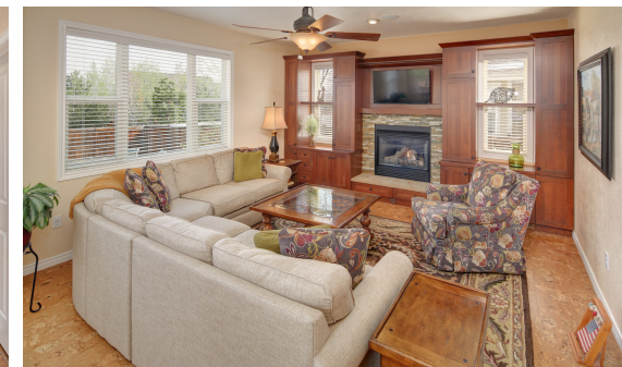
Fort Collins Stanton Creek