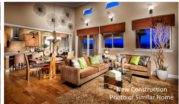
New Construction Photo of Similar Home