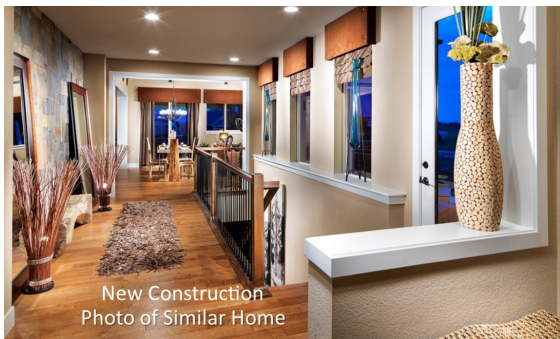
New Construction Photo of Similar Home