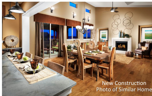
New Construction Photo of Similar Home